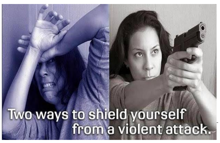
"The battle, sir, is not to the strong alone; it is to the vigilant, the active, the brave." —Patrick Henry